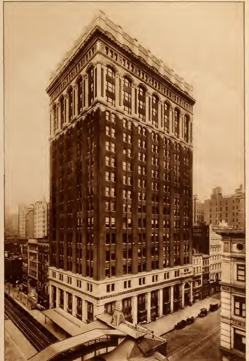
MASONIC TEMPLE. Located on the Northeast corner of 6th Avenue and 23rd Street. Was erected in 1913 on the site of the old Masonic Temple.